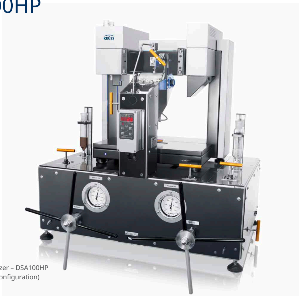
Drop Shape Analyzer – DSA100HP (DSA100HP1750 configuration)