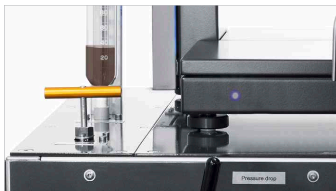
Either a gas or a liquid can be added as surrounding phase.