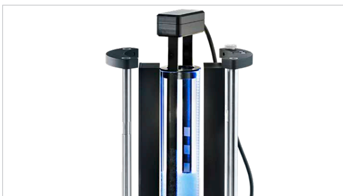
Conductivity sensors for analyzing liquid content

In addition to showing moisture as a direct quality criterion for foam, liquid content measurement also reveals the stability, because the discharge of liquid from the foam lamellae (drainage) is the first sign of decay. Therefore, accurately measuring the liquid content as a function of time is ideal for evaluating foams in the range of long-term stability. Since it is not necessary to wait until the foam height decreases, detecting moisture can save measuring time and significantly increase sample throughput.