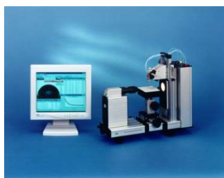
Drop Shape Analysis System DSA10

Application report: AR224e Industry section: Polymers Author: CR Date: 2001