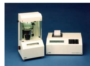
Force Tensiometer – K12